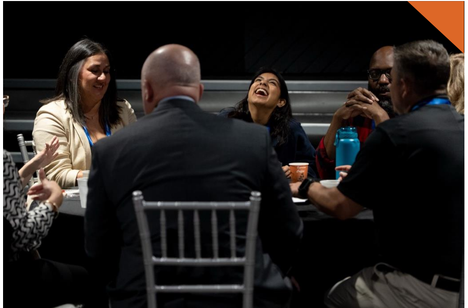
Participants during the State of Teaching Event in San Antonio, Texas on April 14, 2026